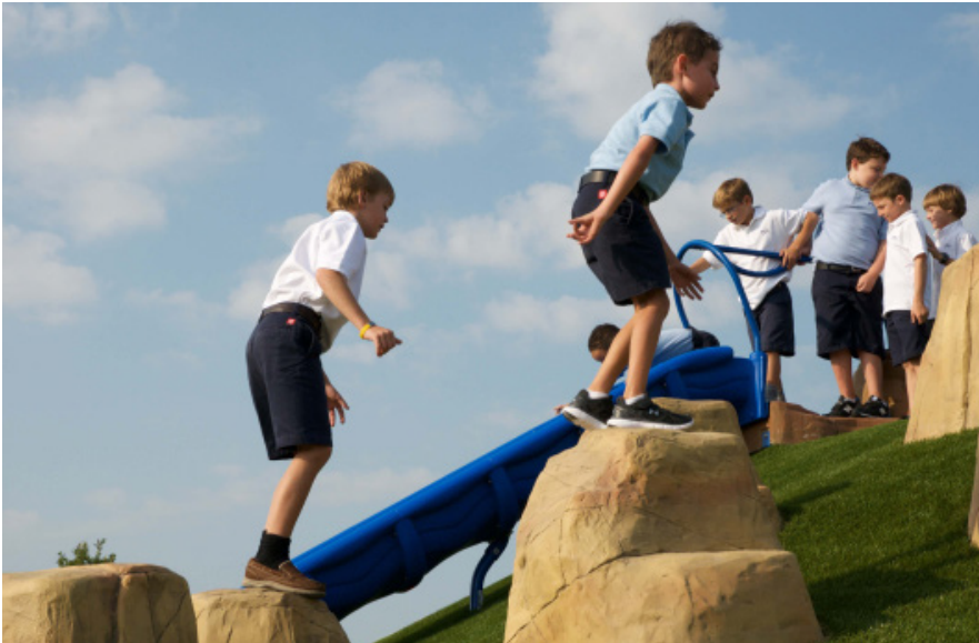
Playground designed as natural, park-like setting to leave play to the child's imagination