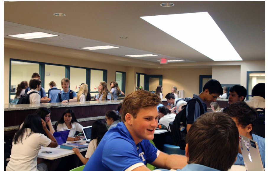
Light well positively impacts learning in Upper School Commons