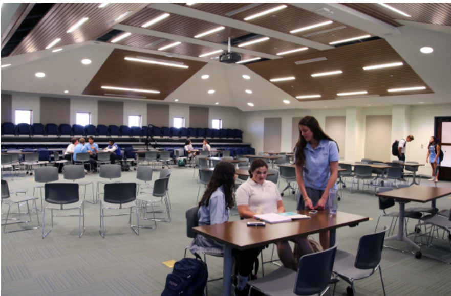
Students collaborate in Trojan Hall